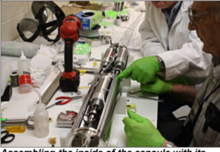
Assembling the inside of the capsule with its various rams, wires and sensors

way down through and exit the reactor from the bottom. There, they are monitored for remaining full to use are monitored for remaining fuel to make another pass. Or, if the useable fuel is consumed by the time it reaches the bottom, it is collected for disposal. A second design utilizes a honeycomb block of graphite into which fuel rods would be inserted