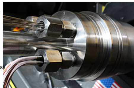
Pnuematic tubes and sensor wires seperate at back end of capsule.

By using pneumatic rams to adjust the pressure on the graphite samples, experimenters will avoid the warping and even possible failure of the pressure adjusting mechanisms that troubled early