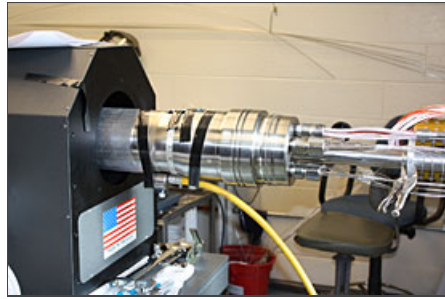
End of capsule protrudes from automatic welder near end of assembly process.

None of this could have been accomplished without a world-class design and fabrication team. The finished test capsule, with its shiny stainless steel shell and protruding wires and cables off the back end, almost looks more like something from a hot-rod spaceship than a highly sophisticated piece of experimental equipment.